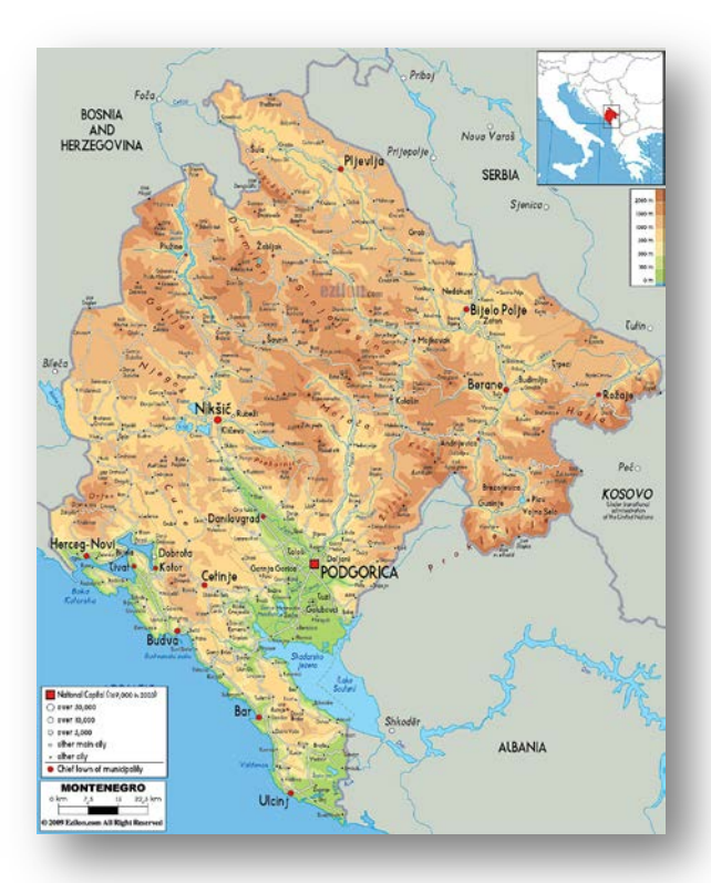
Figure 2. Detailed map of Montenegro

The December 2010 floods had unprecedented water levels, the extent of flooded areas and damage occurred in 12 out of 21 municipalities in Montenegro. Transport routes, electricity