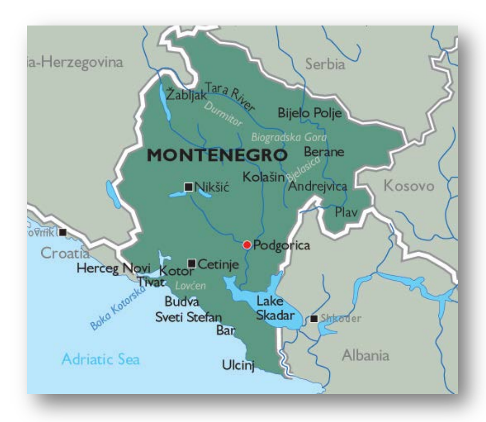
Figure 1. Montenegro in the region of the Western Balkans

According to an international assessment (EU-UNDP, 2011), based of consultations with a wide range of stakeholders, the strengths and gaps for the disaster risk reduction, protection and relief policy of Montenegro include: