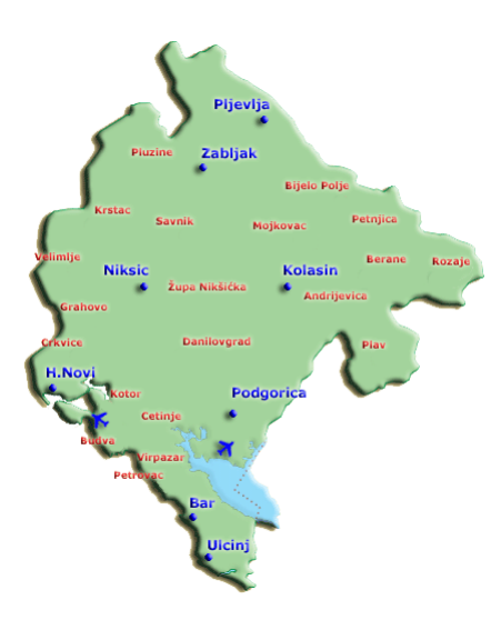
Figure 4. Reference map on hydro and meteo data collection and early warning stations.

The Seismological Observatory operates three different types of networks monitoring seismic risks: 10 short period stations, 4 broadband stations, and 4 accelerometric stations recording ground motion parameters.