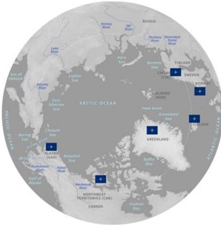
Figure 1: The Arctic.

Climate trends remain a key driver of regional activity, with the Arctic warming at a rate likely four times faster than the global average. 1 The region is being transformed by climate events and increased extreme weather phenomena, leading to significant coastal erosion, permafrost thaw, and ice melt. This fragile ecosystem is undergoing rapid changes as air, water, and land temperatures rise. Alongside these challenges, however, warming trends are also creating new opportunities in the region.