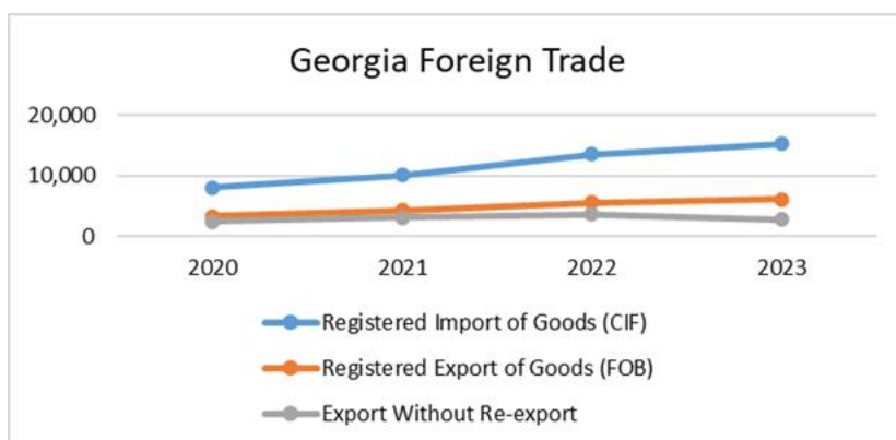
Figure 1: National Statistics Office of Georgia. 36

Evidence of this can be seen in official data provided by the Georgian Finance Ministry's Revenue Service and the National Statistics Office of Georgia, which partially reflect Georgia's policies and responses to the sanctions against Russia. The data shows that in 2022, Georgia imported a record $13.5 billion worth of goods, representing a 33% increase compared to the previous year. Preliminary data for 2023 indicates an even higher import volume, reaching approximately $15.5 billion.