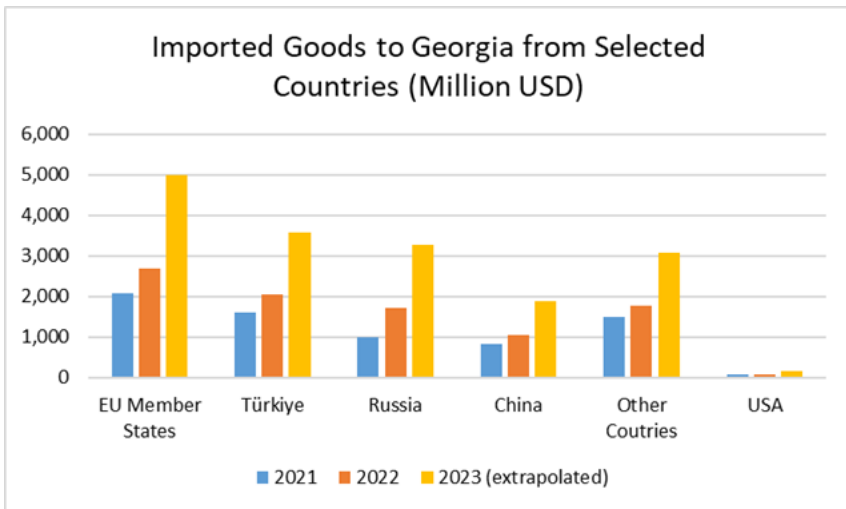
Figure 2: Data from the Customs Department of Georgia’s Revenues Service, August 25, 2023.

Based on official data from 2021-2022 and extrapolations for the first eight months of 2023, Russia has emerged as Georgia’s second-largest trading partner for 2022-2023, following Türkiye and ahead of China. In 2023, Russia’s share in Georgia’s total foreign trade volume reached approximately 11-12 %, comprising 11 % in exports and 11.7 % in imports.