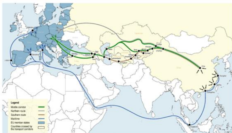
Figure 4: The MC among Trade Corridors Connecting Europe and Asia. 56

the leading transit destination (24%), followed by Türkiye (21%) and Azerbaijan (21.4%). Russia's share, which stood at 11.35% in 2022, increased to approximately 16% in 2023, while there were minimal changes in the data for other countries. The volume of transit cargo (in kg) to Belarus also rose 15.5 times. However, this figure may seem substantial because transit to Belarus was previously negligible compared to other countries, being ten or more times smaller than the volume of transit to Azerbaijan and Türkiye. 57