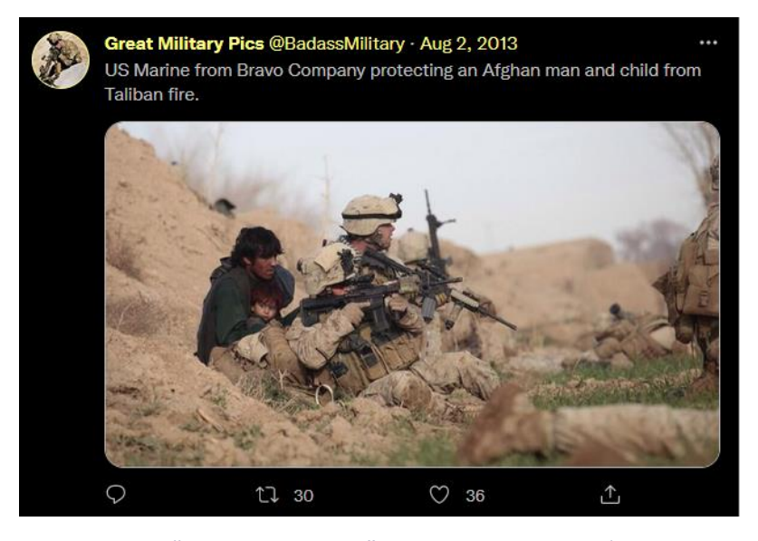
Figure 3: Posting by "Great Military Pics" Twitter account, 2013 (source unknown).

All these characteristics are illustrated in the following picture, aptly found in the "Great Military Pics" Twitter handle. This picture implicitly encapsulates P-plot of menace being held off, A-archetype of a protector defending innocents, I-imagery of munitions being used to hold the line "between a rock and a hard place," and V-values of security and freedom from terror. While not every military tweet can be this dramatic, this one offers an example of the kind of in media res action and evocative contrasts to which military storytelling should aspire.