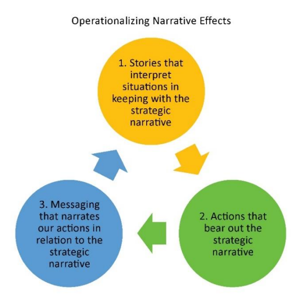
Figure 2: The Three Modes of Operationalizing Narrative Effects.

Given that many militaries are already committed to the idea of strategic narrative, they are in an excellent position to excel at this type of narrative communication if they have the will and skills to do so. It is a Strategic Communications commonplace that military operations should be guided and justified through the use of strategic narrative. <sup>15</sup> Yet militaries need to put much more thought into how strategic narratives can be effectively communicated to audiences through telling and enacting stories that would make these narratives meaningful and convincing. We propose three main interconnected vehicles for militaries to achieve narrative effects, namely (1) by telling stories about relevant situations that interpret them via narratives; (2) by initiating actions that bear out narratives; and (3) by initiating messaging about their actions that narrates how these actions are congruous with them.