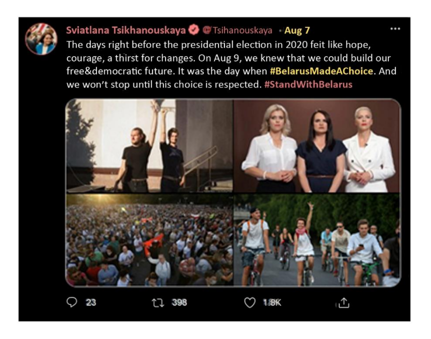
Figure 4: Tweet of Sviatlana Tsikhanouskaya, August 7.

allied circles, perhaps in part because her story revived a classic comedic (which is not the same as funny) plot structure going back to the Roman period, in which courageous young people struggle against decadent old tyrants to build a world in which they can love freely.