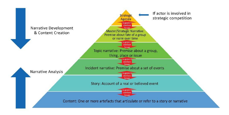
Figure 1: Narrative Analysis and Design Model.

information environment, such tools can help militaries makes sense of narrative-lay-of-the-land and how they can effectively engage in it.<sup>14</sup> We propose using a pyramid-like narrative model for processing data on stories circulating among groups to facilitate a broader understanding of the narratives they favor on various topics and underlying master narratives that structure their perspectives.