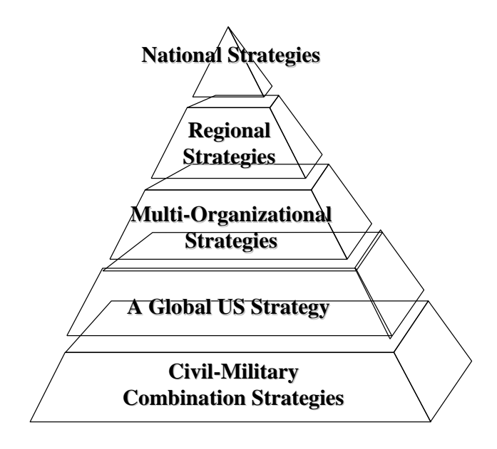
Figure 1: The Pyramid of Strategy Development.

strategies, will actually involve a combination of military and non-military means, but to a degree that is historically unprecedented. (See the discussion of Combination Strategies later in this article.)