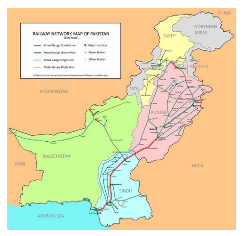
Figure 2: Rail Networks inside Pakistan.

The physical infrastructures of Eurasia—the roads, bridges, airports, railroads, pipelines, waterways, seaports, electrical grids, and telecommunication systems—continue to shape the patterns of commerce and movement throughout the Eurasian land mass. The influence of these public infrastructures is particularizing and isolating, hindering trade and development and creating great obstacles for cooperation across the region. Rail connections in these countries connect to the rail system that dates from the Tsarist period. The road and rail infrastructure developed during the Soviet period was basically organized on a centrist model, with transport spokes radiating out from Moscow. The fixed infrastructure was not well configured to promote regional trade and development, and even less well config-