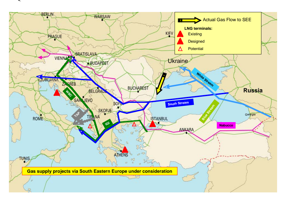
Figure 1: Gas Transit Projects in the "Southern Corridor"

to start operation soon, will initially supply limited volumes of gas to the town of Komotini in northern Greece, and later will grow into a gas pipeline extending to southern Italy (it is known as the IGI Project, or Poseidon). The establishment of an inter-systematic link between Bulgaria and Greece could bring these supplies of gas into the Bulgarian market.